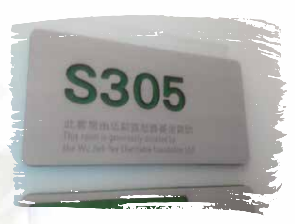
伍絜宜慈善基金慷慨贊助 Wu Jieh Yee Charitable Foundation Limited