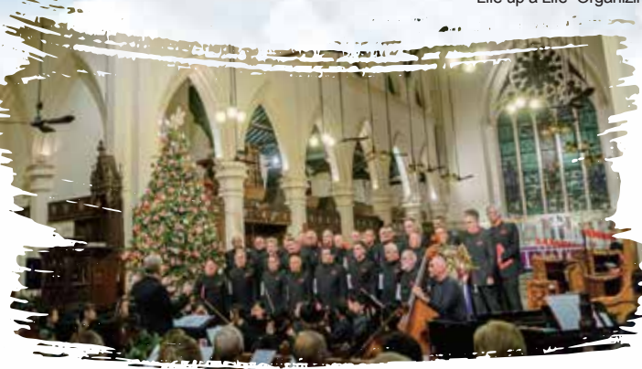
設置於座堂內的「生命樹」是音樂會中的重點環節,樹上滿佈思念故人的祝福卡。 The "Tree of Life" placed inside the Cathedral decorated with cards and messages commemorating deceased family members and friends