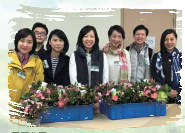
園藝義工 Flower arrangers