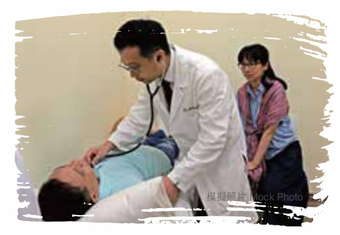
日間服務 Day service

We may also offer aromatherapy, a form of alternative therapy utilizing plant-based essential oils, to provide both physical and psychological relief. This is only available to inpatients and day patients at the moment.