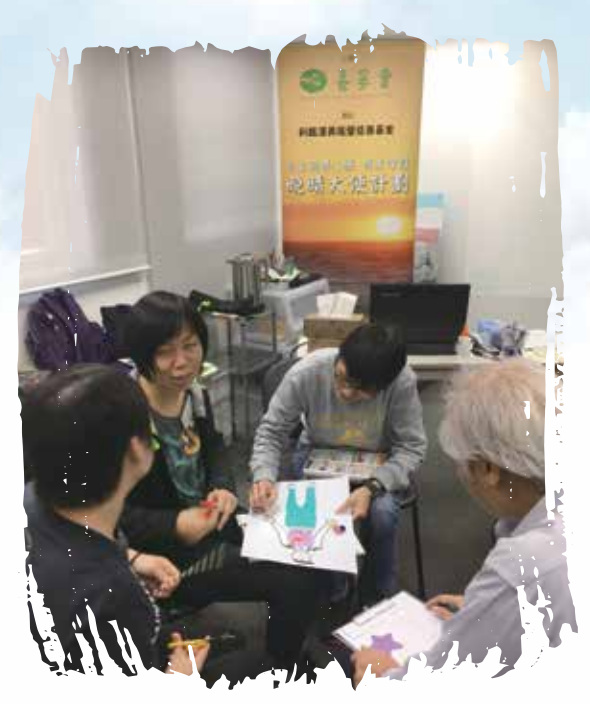
參與計劃的晚晴大使上課情況 Latter Life Ambassadors in the lesson

晚晴大使到訪全港各區推廣自主晚晴 Latter Life Ambassadors promote "Advance Care Planning" in the community