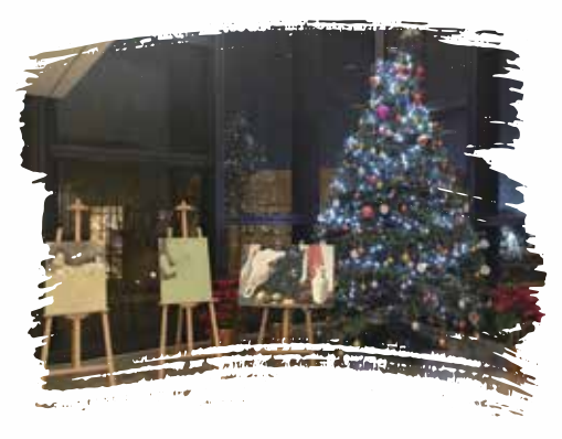
置於賽馬會善寧之家大堂的聖誕樹由渣打銀行捐出 "Tree of Life" at the JCHH Podium donated by Standard Chartered Bank (Hong Kong) Ltd