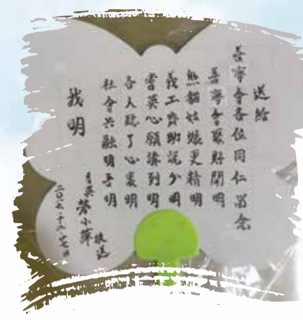
「自主晚晴心願」長者小組正面的回饋 Encouraging feedback from the elderly in the ACP treatment group

Programme - Latter Life Ambassador Scheme" since 2015. The Scheme's goal is to groom existing volunteers to be "Latter Life Ambassadors" and promote Advance Care Planning (ACP) to the elderly and patients. In 2017/18 FY, the scheme has conducted 9 training courses, workshops and visits.