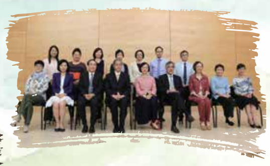
第十四屆香港紓緩照顧專業研討會的嘉賓講者及籌委會成員大合照 Guest speakers and committee members of the 14th Hong Kong Palliative Care Symposium