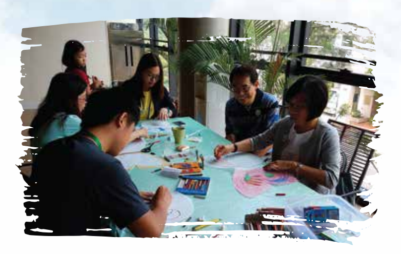
「《串串鷂串串情》手工串鷂工作坊」Counselling Kite Workshop

In 2017/18 FY, grief counselling services went out to over 200 families - serving 500 individual clients and helping them establishing contact with thousands of patients and family members. In addition to emotional support, our team placed emphasis on facilitating family communication in end-of-life care and in facing imminent separation. Different types of support were provided to help patients and families reduce stress and promote bonding. Below are some examples: