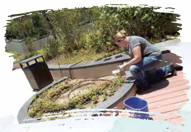
園藝義工 Gardening volunteers

義工是善寧會的重要伙伴。有賴本會義工們參與和協助不同形式的活動及義務工作,善寧會得以減輕運作成本,讓更多有需要人士受惠。 Volunteer is our valuable partner. With them, we are able to minimize our operating cost and channel our fund raised directly to the people in need.