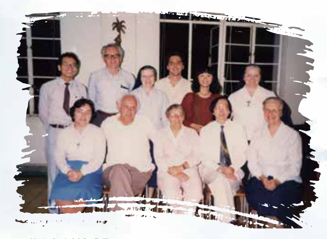
善寧會的創會成員 SPHC's Founding Members

本會獲香港特區政府撥地及香港賽馬會慈善信託基金的撥款支持,「賽馬會善寧之家」於2017年9月28日 正式開幕,為全港首家引進嶄新的「家庭為本」寧養服務模式的獨立寧養中心,提供整全、個人化的一站 式寧養紓緩服務,從身、心、社、靈幾方面減少病者及家人的痛苦,支援及鼓勵家人積極參與照顧病者, 陪伴他們有尊嚴地走過生命最後一段路。