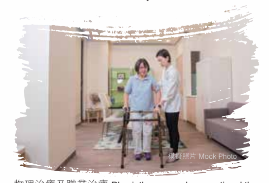
物理治療及職業治療 Physiotherapy and occupational therapy