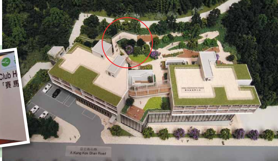
天橋（紅圈示）連接4樓與花園，讓病人可散步前往花園，加強病人與大自然的連繫。 A footbridge (marked in red circle) connects level 4 and the garden, where patients can stroll to the garden without taking lifts or stairs.

吳永順闡述：「為了讓病人及其家人與大自然的連繫更親近、更直接，花園的位置亦經過巧妙安排——花園除與3樓套房為鄰，更另設天橋連接4樓套房，讓病人及其家人可推著輪椅輕鬆漫步前往，免却乘搭升降機或上落樓梯的不便。事實上，樹木成蔭的花園不但給予一家人聚首空間，也讓他們可以在謐靜而安全的環境進行輔導或互訴心聲。」