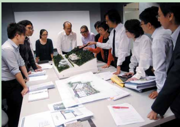
新寧養中心工作小組每兩周舉行會議。 The project consultants team at one of its bi-weekly project meetings.

The mission of “Jockey Club Home for Hospice” is not limited to offering enhanced end-of-life care to terminal patients. It will also act as a training and education centre where seminars and training programmes will be held. All in all, the new project serves to boost public awareness towards the importance of holistic and palliative care for terminal patients, and for their families, a full and positive life.