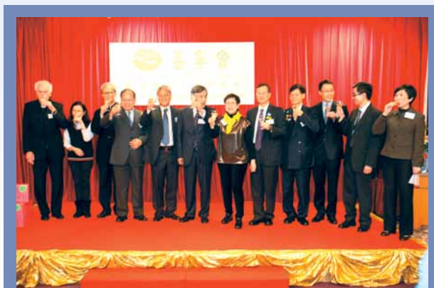
善寧會執行委員會委員向出席義工祝酒。 SPHC Executive Committee Members propose a toast to all volunteers.

晚宴在一片歡樂聲中進行，除了有多個刺激緊張的遊戲外，更有幸運大抽獎，送出由執行委員會委員捐助的近 80 份禮物；特別大獎為香港快運航空贊助的雙人來回機票。所有參加者都帶着喜悅和獎品，滿載而歸。