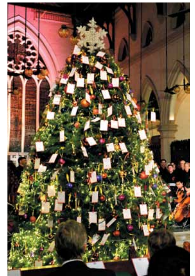
「生命火花樹」為已故或瀕留病榻的親友送上祝福。 "Tree of Life" - A light shines for each person remembered.