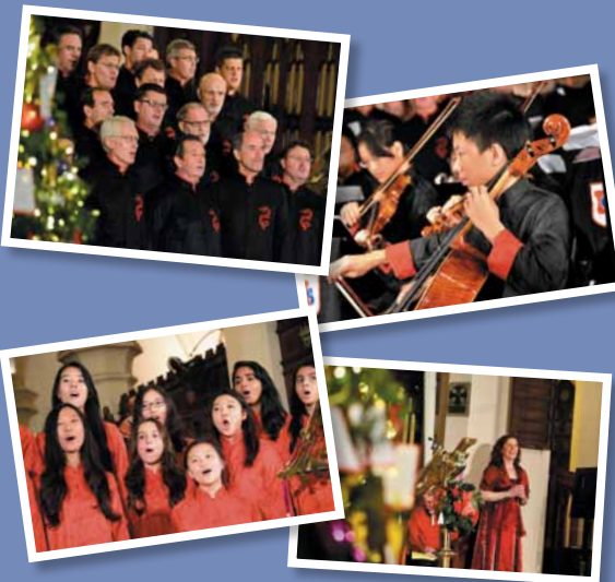
一眾表演嘉賓落力為我們帶來美妙的聖誕詩歌。 The performers bring us beautiful Christmas Carols.