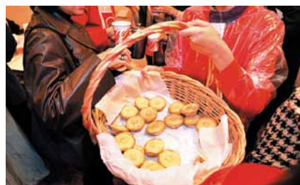
美味的傳統餡餅和暖酒。 Delicious traditional mince pies and mulled wine.