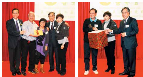
幸運大抽獎得獎者都以興奮心情上台領獎。 Lucky draw winners receive their prizes with great excitement.