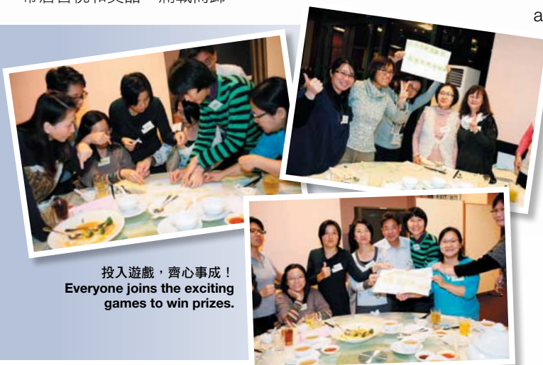
投入遊戲，齊心事成！ Everyone joins the exciting games to win prizes.

The dinner was filled with joy and cheers. In addition to many exciting and interesting games, the dinner was climaxed by a lucky draw of almost 80 prizes donated by members of our Executive Committee. The special prize was two round trip air tickets sponsored by Hong Kong Express. All participants had great fun and enjoyed the evening.