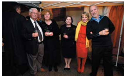
嘉賓聚首一堂參與音樂會後的派對。 Guests gather to enjoy the party after the concert.