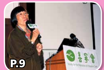
慈善首映禮 Charity Film Gala Premiere